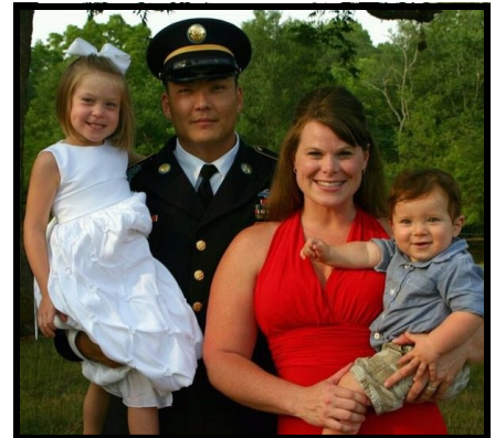
The Gonzales Family