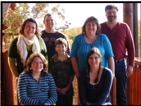
The Zeuke Family