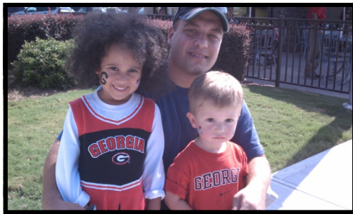
The Deutsch Family