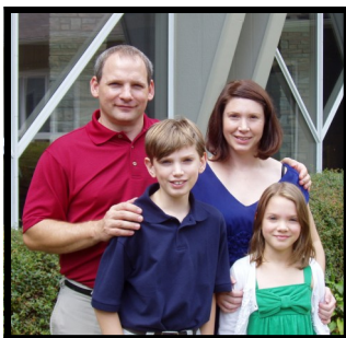
The Veeder Family