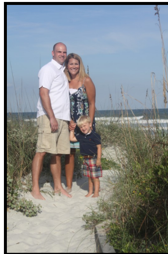
The Bullock Family