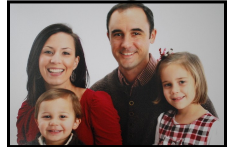
The Malueg Family