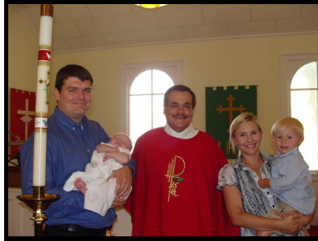
The Tedder Family