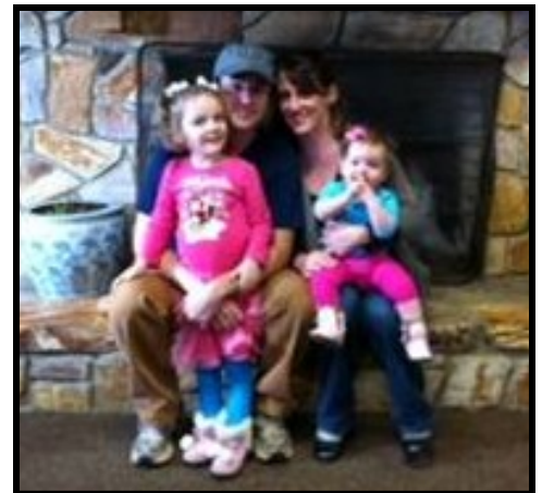
The Musgrove Family